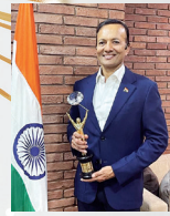
Naveen Jindal, Chairman, Jindal Steel & Power