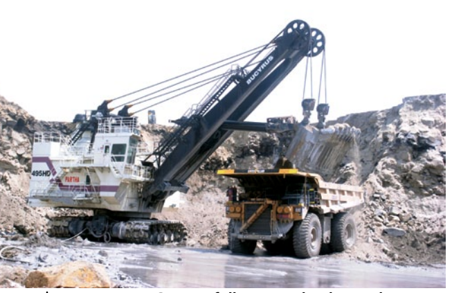
Gmmco fully meets the demand for mining equipment.

in the India business, Gmmco is able to meet the demand fully for surface and underground mining equipment. Good forecasting methods and processes are used by Gmmco-Cat to bridge any demand-supply gap.