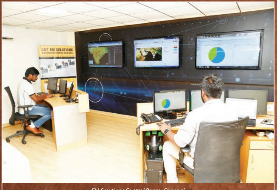
EM Solutions Control Room, Chennai

We have equipped ourselves to offer a gamut of online digital services to exceed the expectations of our customers. Our equipment monitoring solution enables customers to monitor their machine and its performance remotely using a smartphone. Our Gmmco Assist mobile application helps our customers to transact with us digitally by ordering parts,