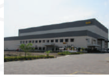
Butibori* MRC (2015)