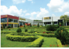
Nagpur* CRC (1997)