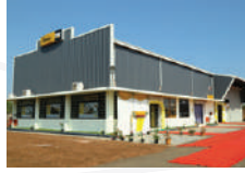
Kannur CRC & MRC (2016)