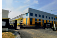
Chennai CRC & MRC (2018)