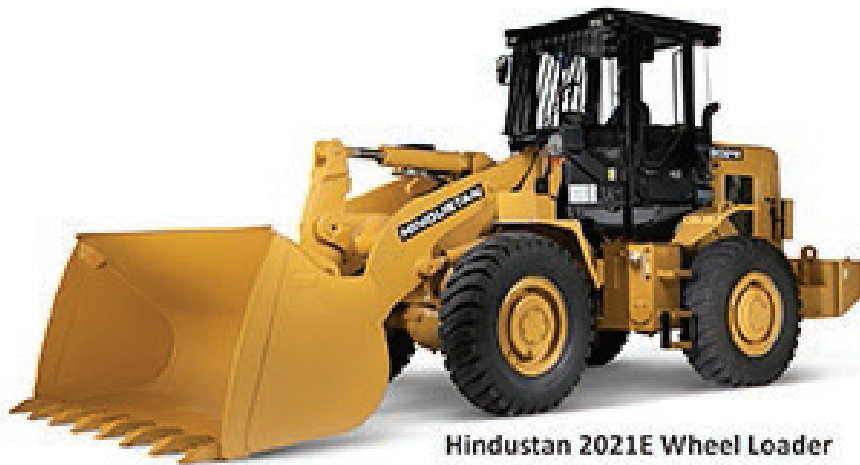
Hindustan 2021E Wheel Loader